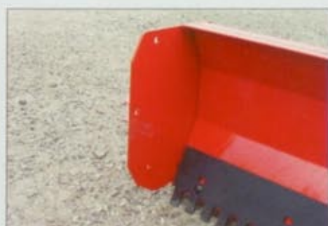
The side/end plate can be fitted both to the right and left hand side (blade height 60cm/23,6 in). Mounted with three bolts.