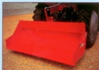
Back tip shovel: T-200 with rear board. T-220 with automatic dumping.