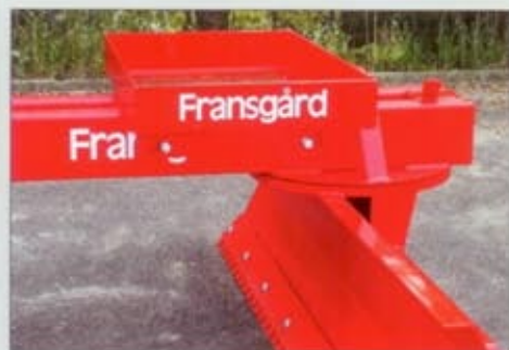
Counter weight box is available for GT models. Does not fit model GT-250HY.