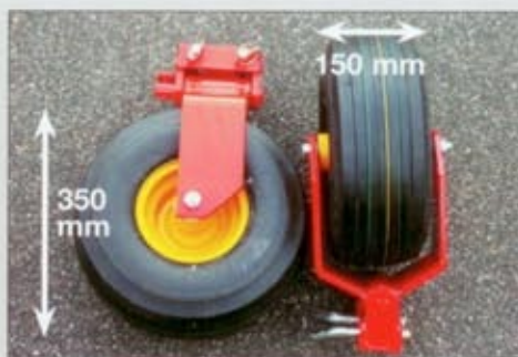
Wide gauge wheels are fitted with long-wearing double bearings and flotation treads.