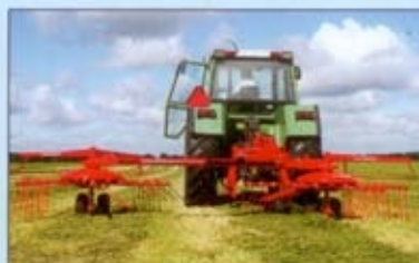
The biggest world wide range of multi function rakes: 9 models.