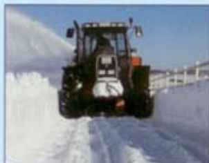
5 Snow blower models for front and rear mounting.