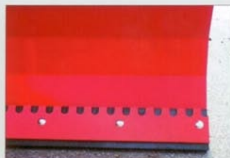
Rubber wearing strips, mounted under the cutting edges provide protection to hard surfaces. (asphalt, concrete etc.)