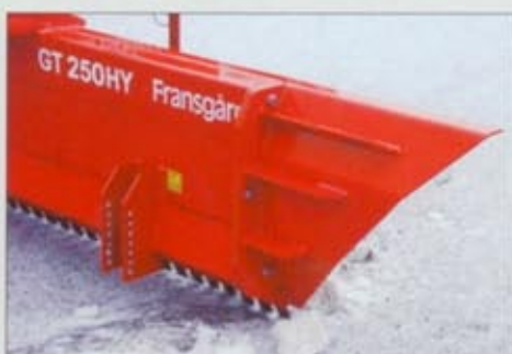
The snow wing is puts a finishing touch to snow removal. The wing creates an angle on the snow edge preventing the snow from sliding back down.