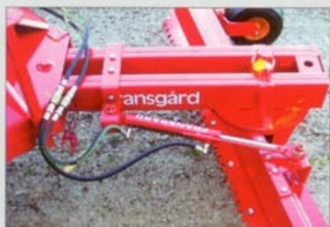
A hydraulic toplink with attachment brackets is available for blade adjustment.