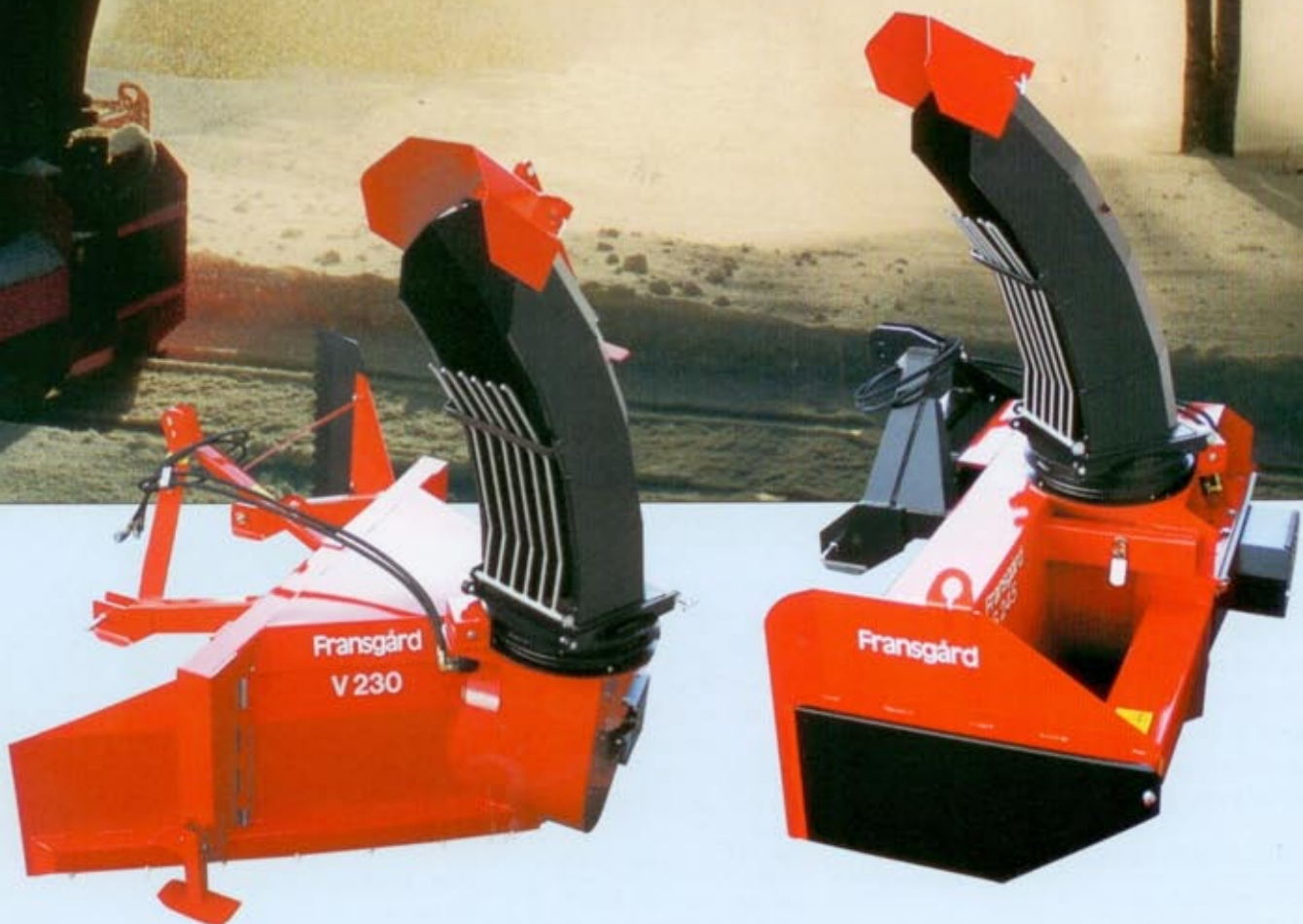
V-215 / V-230